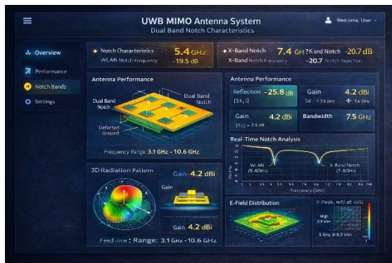
Figure: Home page